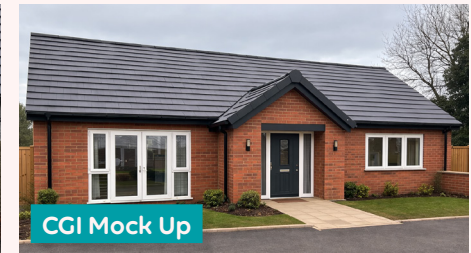
CGI Mock Up