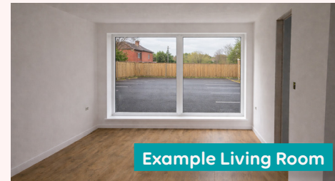
Example Living Room