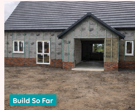
Build So Far