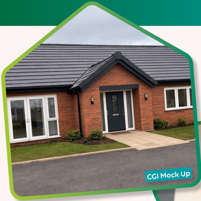
CGI Mock Up