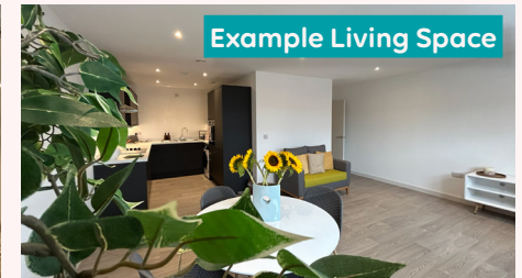
Example Living Space