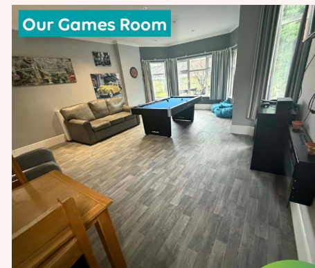
Our Games Room