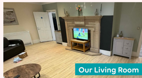
Our Living Room